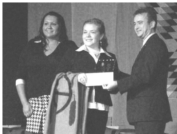
Congratulations to the recipients of the 2007 Manitoba Aboriginal Youth Achievement Awards

pelting demos, followed by live music in the evening. Coffee will be served. Saturday morning business meeting, election of Zone Directors, reports from fur auction houses, and participation by Manitoba Conservation Wildlife Branch. Dinner Banquet will be followed by awards, live auction and giant raffle draw in the evening. For registration costs and further information please call MTA at (204) 345-9107 Email: mts@mts.net