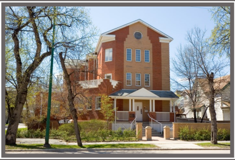
Located at 566 Bannatyne Avenue, Winnipeg, MB Ronald McDonald House Charities Manitoba has helped families heal together for over 30 years. (Since 1984)

Imagine your child has a life threatening illness or injury. The emotional and financial stress often accompanying childhood illness and injury can be unbearable for families. This is why Ronald McDonald House Charities Manitoba (RMHCMB) strives to meet every family's needs so they remain strong and close, helping them heal better together.